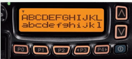
Two line setting display example.

With a high contrast dot matrix display, upper and lower case characters can be easily distinguished. You can change the display setting to show one line and 12 characters, or two lines and 24 characters via programming. LCD backlighting is standard.